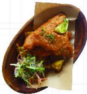
Tilapia Fish n' Chips