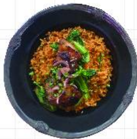
Soy Pineapple Pork Belly

AVAILABLE MONDAY - FRIDAY 11:00 AM - 3:00 PM