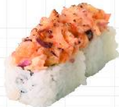
Spicy Tako & Scallop Roll