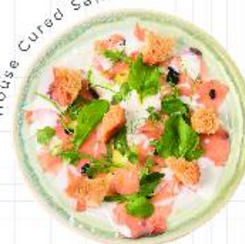
House Cured Salmon