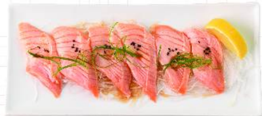
Aburi Salmon Sashimi